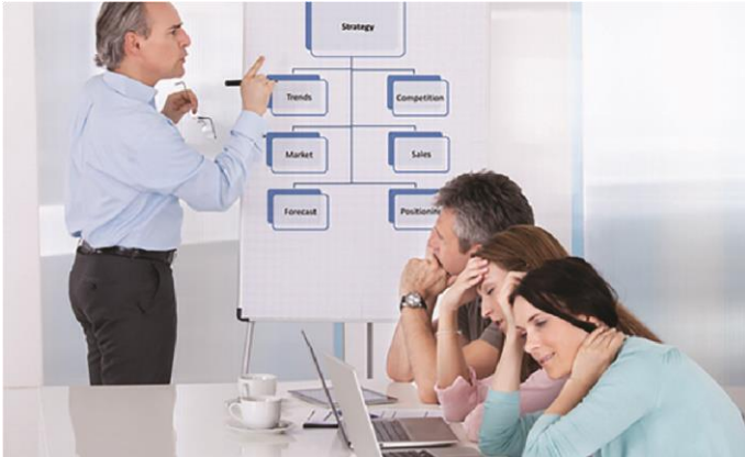
Only if there is too much of this....