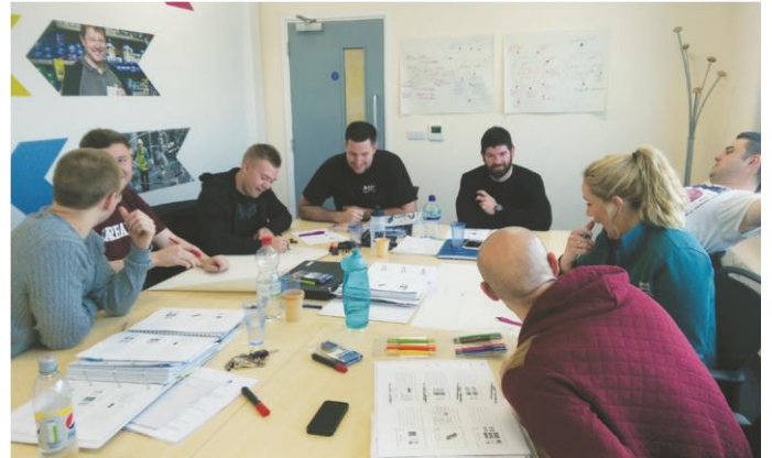
And not enough of this!